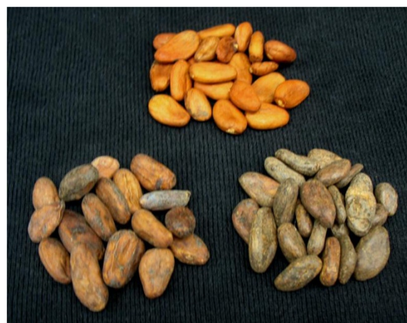
Figure 3 Unfermented and fermented cocoa beans. Mexican Lavado beans (Top, center) with their characteristic terracotta color. In the foreground are Ivory Coast fermented beans (Left; light brown) and Jamaica fermented beans (Right; dark brown).

Two types of cocoa beans were obtained for this study: Mexican unfermented Lavado and Ivory Coast fermented. The Mexican Lavado beans were obtained from AMCO (Veracruz, Mexico) and were processed according to the local Lavado tradition in the Chiapas, Mexico region. The beans were removed from ripe pods, washed by hand with water to remove most of the pulp, then sun-dried. This results in unfermented, terracotta colored beans which are typical from this region of Mexico (Figure 3). Ivory Coast beans were obtained as standard fair average quality beans through The Hershey Company's purchasing department. These beans typically are heap-fermented for four to six days and then sun-dried. Ivorian beans have the typical brown appearance of fermented beans (Figure 3, bottom,