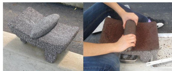
Figure 2 Traditional bean grinding. The metate base with the mano pestle on its surface (left). Bean grinding (right) on the metate. Note the charcoal heat being applied from beneath of the metate.

Beans of each type then were processed in a modern pilot plant to simulate industrial processing and were compared to beans prepared by the traditional Mesoamerican method which included comal roasting, hand winnowing and stone grinding on a metate.