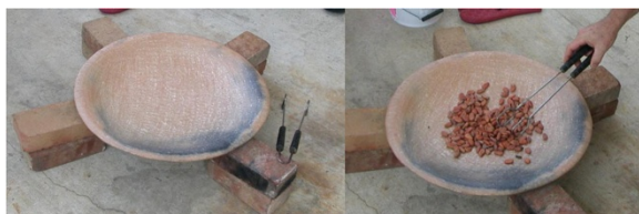
Figure 1 Traditional bean roasting. Comal (Left) with bricks to elevate it above charcoal heat from beneath. Bean roasting (Right) in which 250 gm of Lavado beans are being prepared.

Studies have shown that flavanols are lost during transformation of cocoa beans into chocolate. Therefore, one can ask the compelling question regarding the level of these flavanols: Do traditional processing methods for roasting cacao beans have an advantage over the modern methods used today to produce roasted cocoa beans for making chocolate, perhaps because the process is more natural or not mechanized? The objective of this study is to compare the level of antioxidant capacity, flavanol monomers as well as oligomers and total flavanols in cacao beans processed by traditional Mesoamerican methods to the levels found in cocoa beans processed by modern methods. Here we have studied two types of cacao beans: unfermented cacao beans from southern Mexico, locally known as Lavado beans (lavar, in Spanish, meaning to wash) and conventionally fermented Ivory Coast beans.