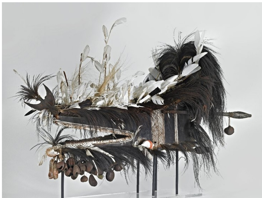
Figure 2 Crocodile head dance mask (Oc,89+.73) Department of Africa, Oceania and the Americas, The British Museum