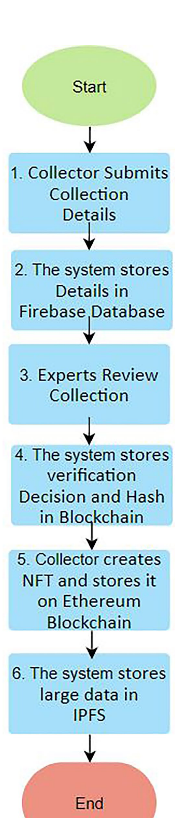
Fig. 1 The workflow of the Salsal Blockchain