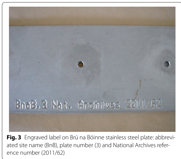
Fig. 3 Engraved label on Brú na Bóinne stainless steel plate: abbreviated site name (BnB), plate number (3) and National Archives reference number (2011/62)