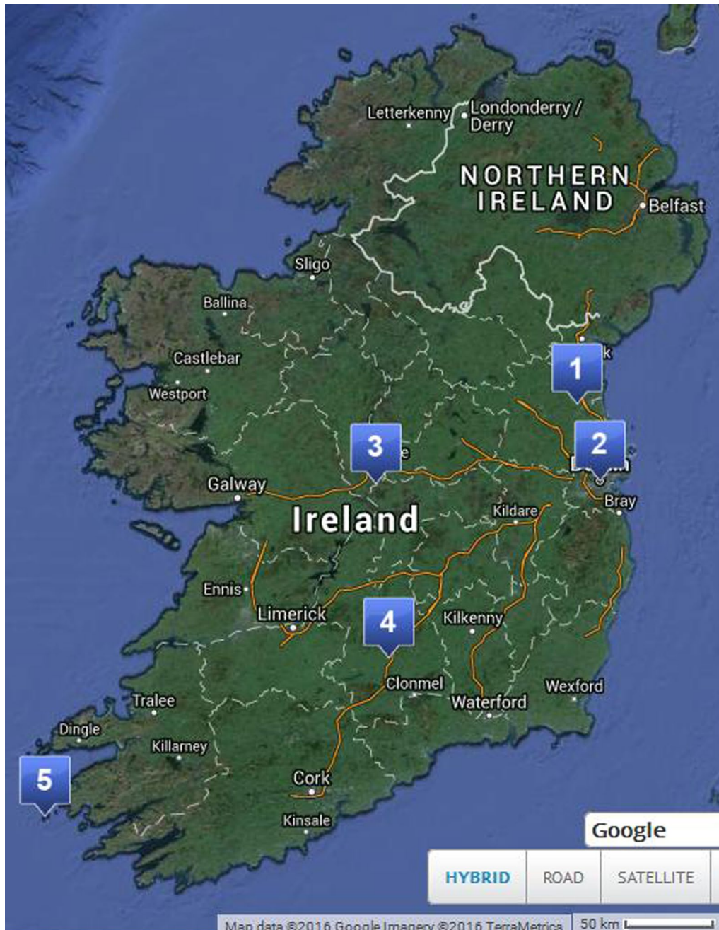
Fig. 5 Location of case study sites around Ireland. ( http://www.scribblemaps.com ); 1. Brú na Bóinne, 2. Dublin Castle, 3. Clonmacnoise, 4. Rock of Cashel, 5. Skellig Michael

Office of Public Works they represent built heritage sites of high importance (including Ireland's two World Heritage properties) and range in date from the Megalithic to Post-Medieval. In addition they provide a diversity of environments including rural (Brú na Bóinne and Clonmacnoise), semi-urban (Rock of Cashel), urban (Dublin Castle) and coastal (Skellig Michael) (Fig. 5).