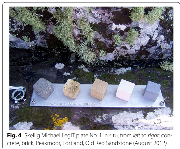
Fig. 4 Skellig Michael LegIT plate No. 1 in situ, from left to right : concrete, brick, Peakmoor, Portland, Old Red Sandstone (August 2012)

were made from stone the same or similar to that used by the original builders (Table 1). At each of the monuments three plates were fixed onto a horizontal surface, for consistency an East West alignment was used (Fig. 4).